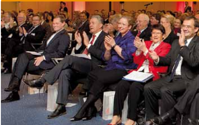
Photo: Berlin Senator of Urban Development Michael Müller, Berlin Governing Mayor Klaus Wowereit, former President of the Bundestag Prof. Dr. Rita Süßmuth and Brandenburg Minister of Infrastructure Jörg Vogelsänger visiting the BBU Association Convention

over 44 billion Euros total investments of member companies (since 1991)